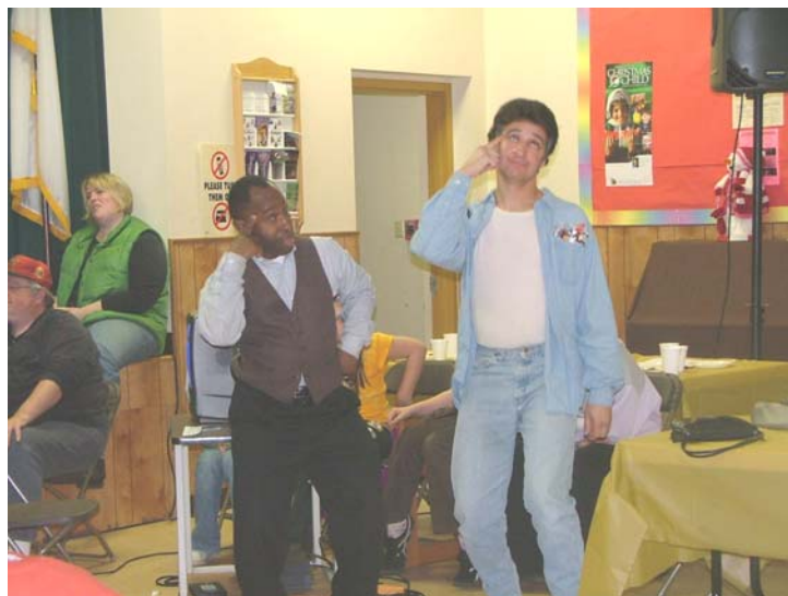
Karaoke Night was a hit. Over $700 was raised to benefit the Deacon's fund.

Come hear our choir perform this great cantata Sun. Dec. 17 at the 10:30 morning worship service, 7:30pm Dec. 14 at the Williams Residence in Manhattan, and 6:00pm Dec. 22 at the Palisades Mall.